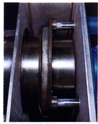
Air-activated choke for less maintenance, better control than spring-activated designs