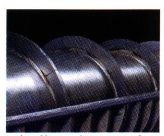
Replaceable wear plates on tapered stainless steel screw shaft